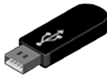
USB File Storage