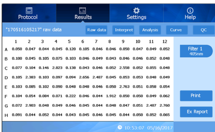
Reading Results Screen

Measurement data is available immediately on the screen after a reading, as well as interpretations, calculated analysis and curve fittings.